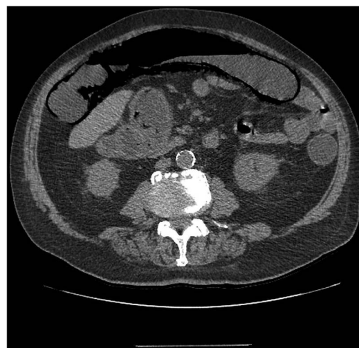
Figure 2 Axial plane CT scan of the abdomen showing pneumatosis intestinalis.

In view of this clinical and paraclinical picture, an explorative laparotomy was performed, revealing widespread colic pneumatosis starting at the caecum and extending all the way to the sigmoid (figure 3). The presence of cloudy peritoneal fluid was also noted. A careful examination of the bowels was performed, but no perforation was found. A subtotal colectomy with mechanical ileosigmoid anastomosis was performed. An ulcerative-like perforation was discovered in the transverse colon during postoperative examination of the specimen (figure 4A,B). The final diagnosis after pathological examination was determined to be