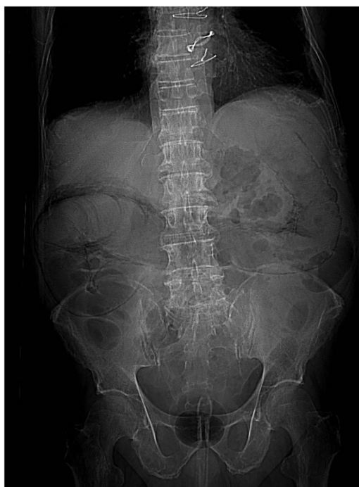
Figure 1 Abdominal X-ray showing signs of pneumatosis intestinalis.

Pneumatosis is a rare disease characterised by the presence of gas in the submucosa and subserosa of the bowel. In a retrospective review published by Koss 1 in 1952, 15% of cases of pneumatosis intestinalis were classified as primary or idiopathic, and 85% were considered secondary. Traditionally, pneumatosis intestinalis was considered to require operative treatment, however, Morris 2 reports that up to 50% of cases can be managed non-operatively. Surgery is advised in cases presenting